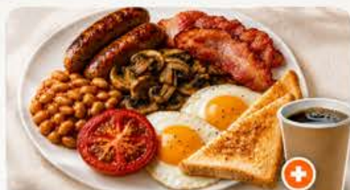
Full English Breakfast