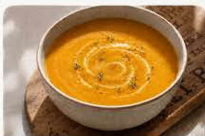
Bowl of Soup