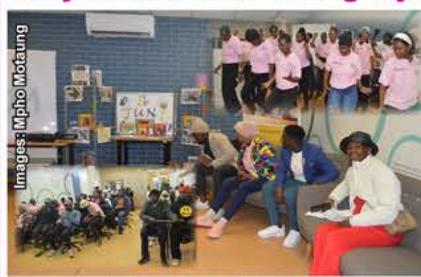
Attendees during the 50th anniversary commemoration of June 16 held at Orange Farm Library in Ext 6b

Young people, community leaders and stakeholders gathered at the Orange Farm Library on 10 June to commemorate the 50th anniversary of June 16 under the theme "Honouring the Past, Engineering the Future: The Current Frontier Spirit."