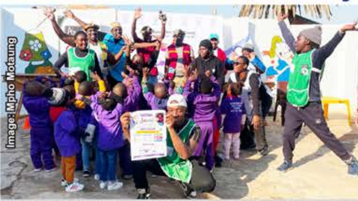
Young learners enjoy creative activities at the launch of the Imbewu - Arts for Early Learning Project

Children from Little Angels Day Care Centre and Masibambane Day Care Centre celebrated the International Day of Play through the launch of the Imbewu - Arts for Early Learning Project, an initiative by Struggles Theatre Productions.