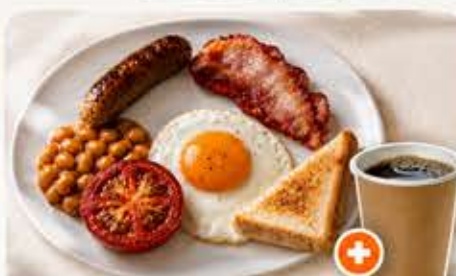
Mini English Breakfast