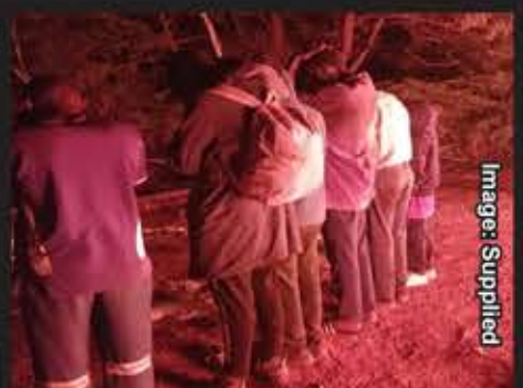
This SAPS-led operation saw boys rescued from an illegal initiation site in Lenasia

Bashanyana ba 'maloa, ho kenyaletsoa le ea dilemo di 13, ba pholositsoe lebellong le seng molaong ka mora difeme tsa Lenasia nakong ea tshebetso e kopanetsoeng ke Kgotla Labo Ntate le Seponesa ka la 14 Phupjane.