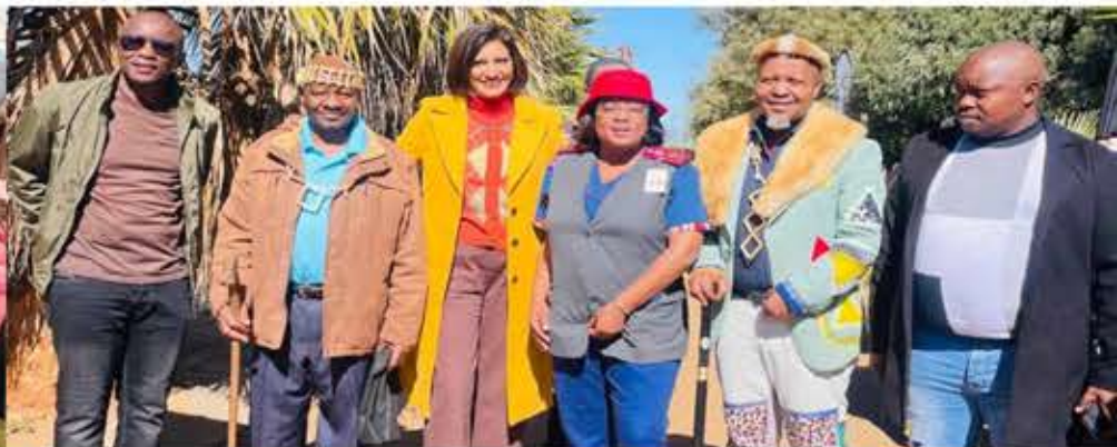
Community members and stakeholders gather during the unveiling of the facility, designed to bring people closer to improved wellbeing

Amsai Primary School in Drieziek 1 was the venue for the launch of the Ananda Jayanti Health and Wellness Hub, an initiative aimed at improving healthcare access and promoting healthier lifestyles within the community.