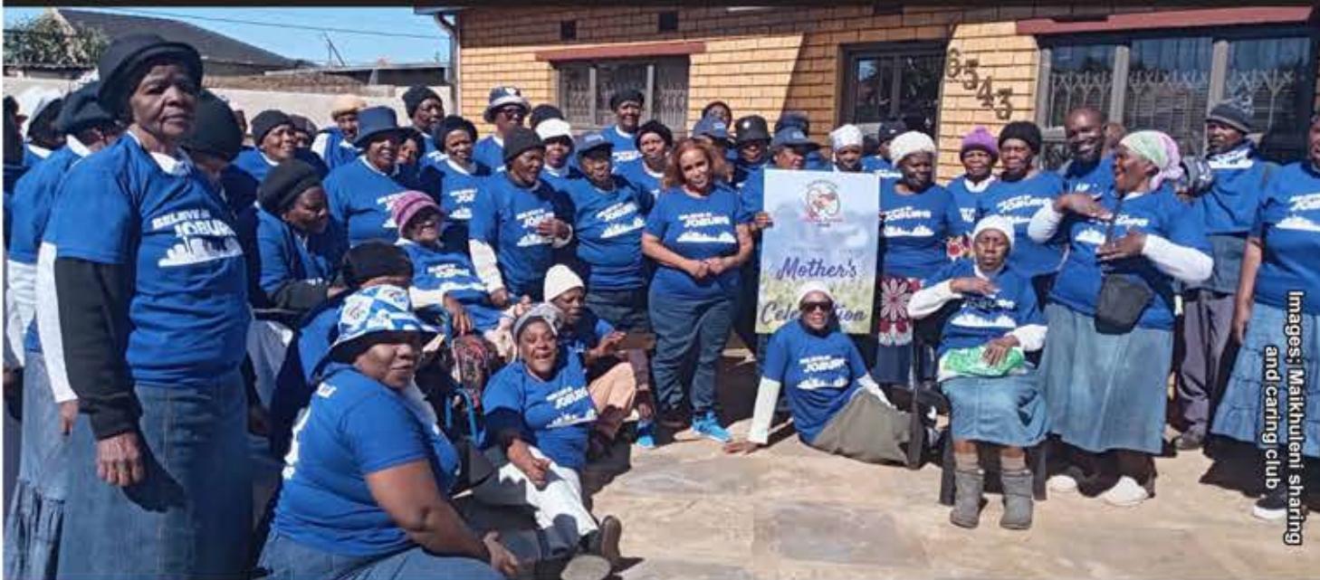
Ext 4 residents gather for a memorable day strengthening bonds and celebrating izimbokodo

Smiles, laughter and appreciation filled the day as Masikhuleni Sharing and Caring Club hosted a Mother's Day celebration on 13 May for community members and elderly residents in Orange Farm, Ext 4.