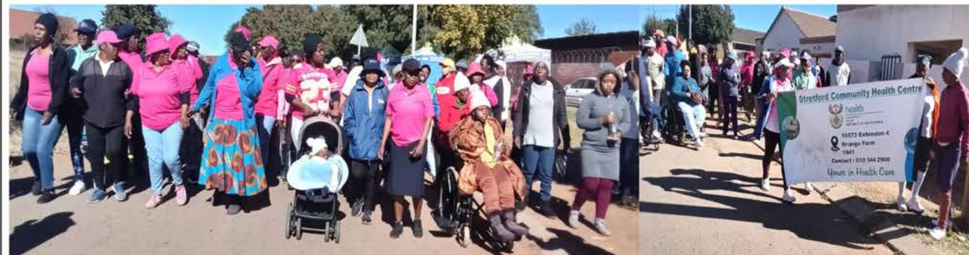
Participants from different walks of life came together in a show of support, unity and community pride during this event

The Modimo O Moholo School of Disability Centre successfully hosted its 5km Fun Walk on 13 May, drawing learners, parents, organisations and community members in a vibrant celebration of inclusion and unity.