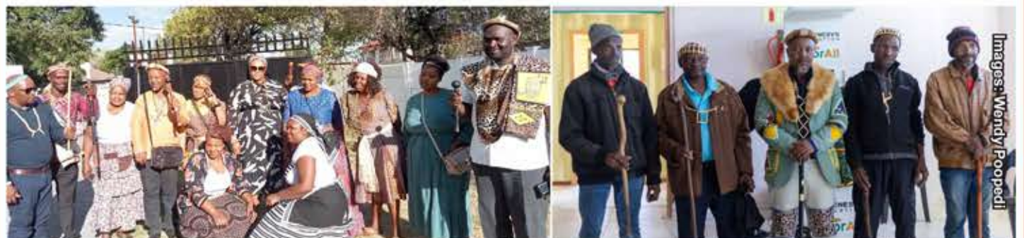
Members of the Royal House promoting cultural heritage and encouraging people to understand their roots

Ukugcina ubuwena besintu ngesikhathi kuthuthukiswa ukuziphatha kahle, ukuzibophezela, kanye nokuziqqaja ngomphakathi kubantu abasha sekuyinjongo enkulu yendlu yobukhosi yasendaweni eseDrieziek Proper.