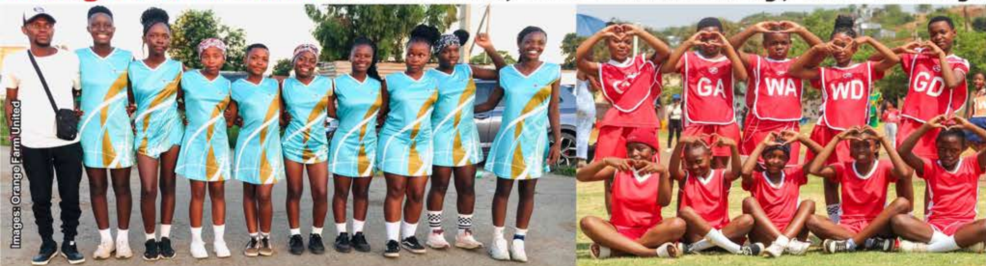
Two different divisions of netball players participate in netball activities during a community sports gathering under Orange Farm United

Their community is often associated with poverty, unemployment, crime and social challenges.