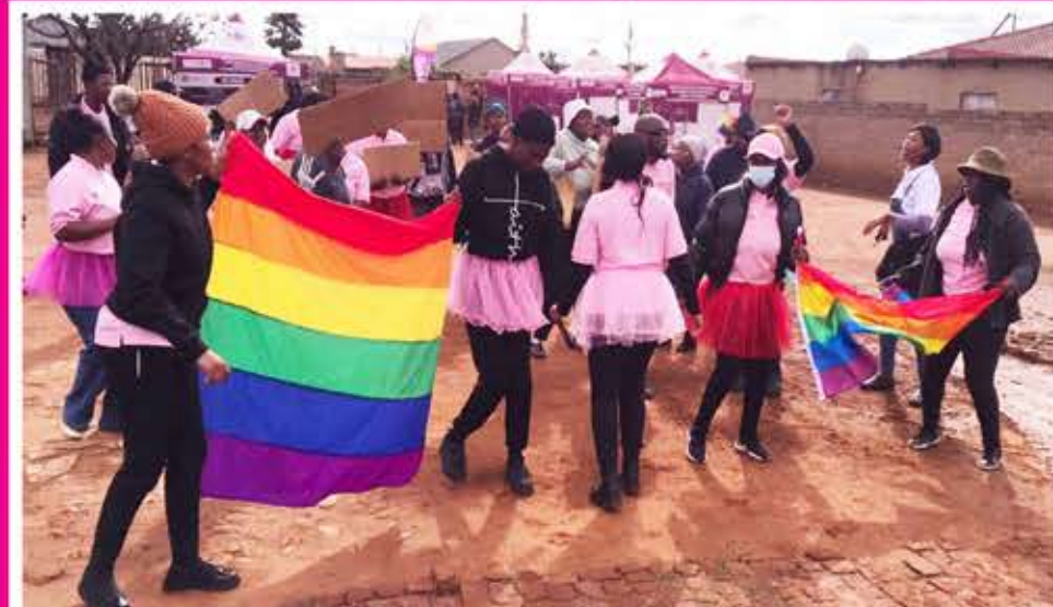
Participants march together carrying messages of awareness, support and inclusion during the community awareness walk

Songs, colourful placards and messages of support filled the streets as members of the LGBTQIA+ community, local residents and healthcare workers gathered for the "Walk With Pride" March and Dialogue hosted by Clean Touch.