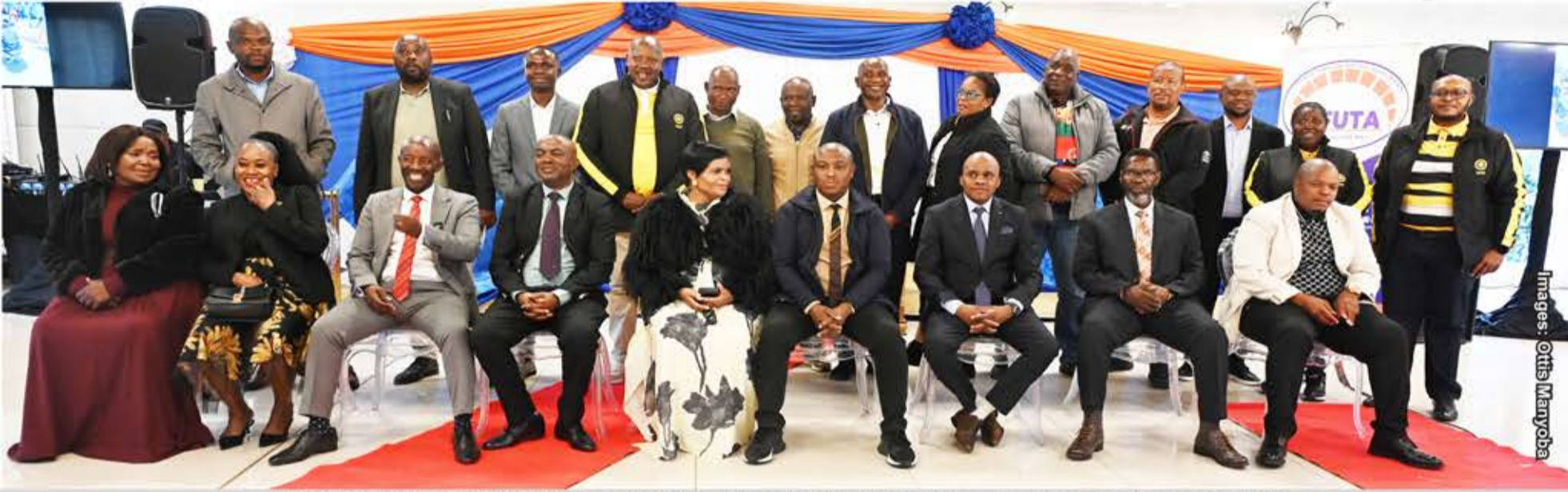
Delegates at the OFUTA 13th Electoral Congress during the election of a new executive committee

The Orange Farm United Taxi Association (OFUTA) held its 13th electoral congress at Balmoral Gardens in De Deur on Thursday, 14 May.