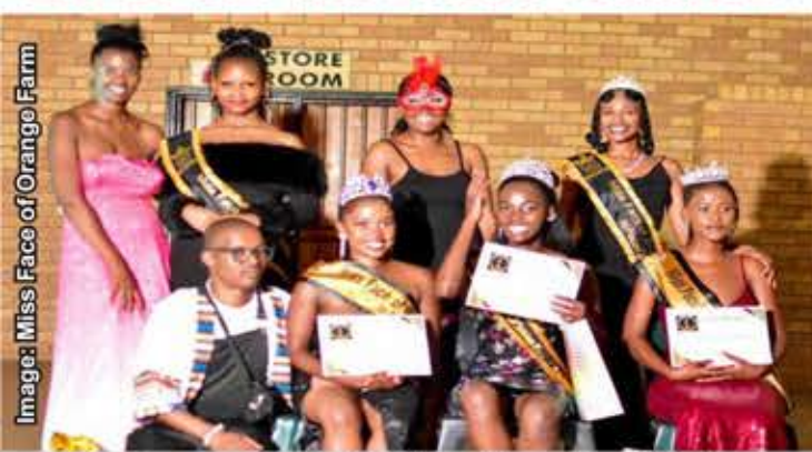
Proud moments as these beauties share the stage following a successful and empowering event

On 28 February, this much-anticipated pageant concluded at the Multipurpose Hall, celebrating beauty, resilience, and community spirit as three young women were crowned winners.