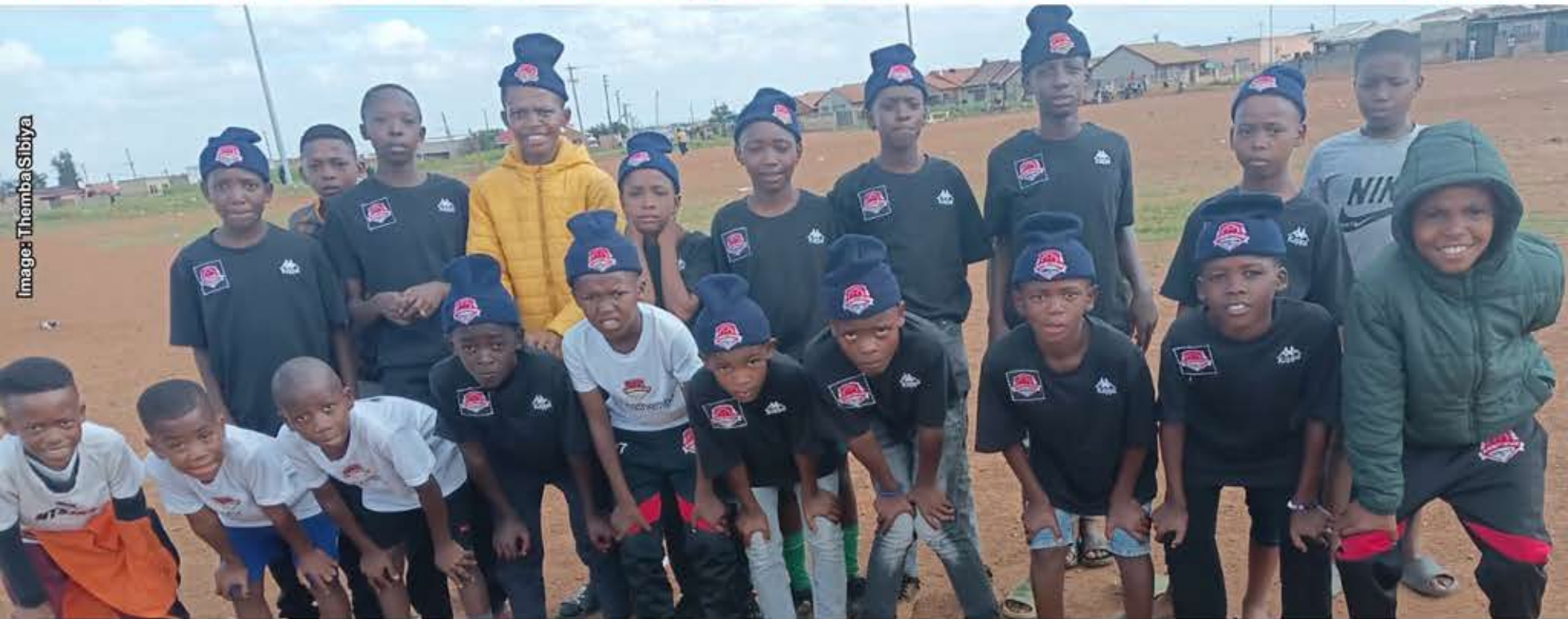
Local rising talent lines up on their home ground, eager and ready to participate in the Super Cup Soccer Tournament

This team, based in Orange Farm Ext 1, has issued a public appeal for sponsorship as it prepares to compete in the upcoming Super Cup Soccer Tournament in Pretoria.