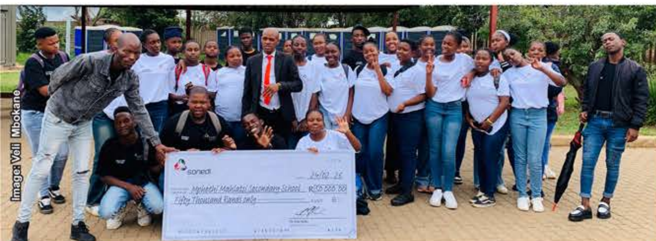
Choir members proudly hold up their sponsorship cheque from SANEDI, awarded in recognition of their achievements across district, regional, provincial, and national choral competitions

This key player in energy and science initiatives, sponsored Mphethi Mahlatsi Secondary School on 24 February after being impressed by the school choir's performance at the Segarona event.